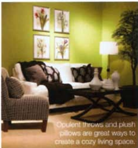
Opulent throws and plush pillows are great ways to create a cozy living space.