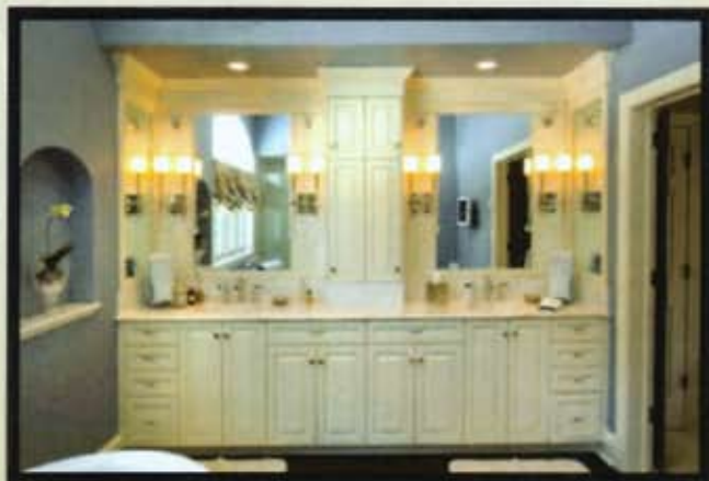
Cabinetry Manufactured by Kountry Kraft

89 Highland Drive Lancaster, PA 17602 P: 717.396.0025 F: 717.396.7920 www.kthighland.com