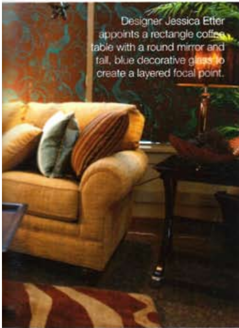
Designer Jessica Etter appoints a rectangle coffee table with a round mirror and tall, blue decorative glass to create a layered focal point.